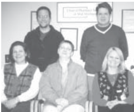
Clinical Pharmacy Services staff.

The Director of the Michigan Department of Community Health commended CMH for the pharmacy initiative which will greatly improve quality of care.