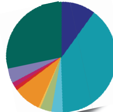
Expenditures Fiscal Year 2008 CLINTON-EATON-INGHAM OPERATIONS ONLY