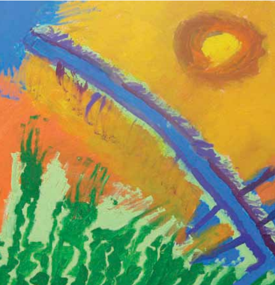
Howard, 16 Take Your Best Shot "This is a person's journey into adulthood. The grass is resistance and resistance is futile."