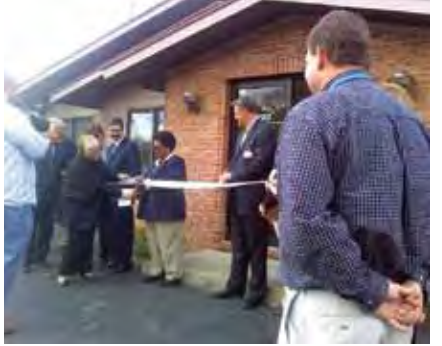
Ribbon cutting ceremony for the grand opening of the "Recovery Center" a clinical detoxification program, located in Lansing, MI.

In early 2009, Substance Abuse Services developed a working partnership with the City of Lansing, Sparrow Health Systems, Ingham Regional Medical Center, Ingham Health Plan, Mid-South Substance Abuse Commission, Volunteers of America, the Lansing City Rescue