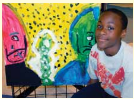
Traveling exhibit of art created by Ingham County youth for Children's Mental Health Awareness Day titled "Who We Are"