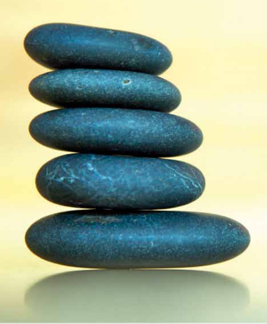
CMHA-CEI holds a vision of a community in which persons with mental health needs have the opportunity - including the necessary services and supports - to participate, with dignity, in the life of the community, with its freedoms, responsibilities, rewards, and consequences.