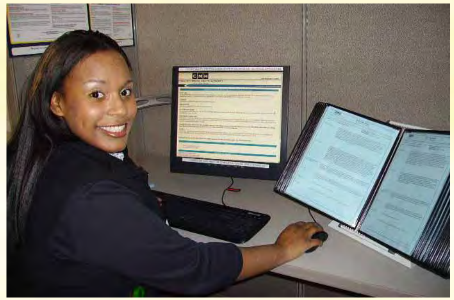
Applying for a job is made easier by using the web based online job application process.