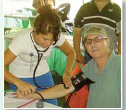
Free health screenings

Sierra Rose Farms -Healing Hearts with Horses Foundation